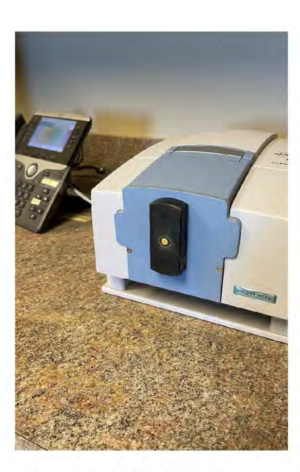
Figure 1 - A Bruker Alpha-II MIR spectrometer scanning a sample. The surface area is the same as the end of a pencil eraser; four subsamples are scanned per horizon.

submitted by Matt McCauley, Owensboro, KY